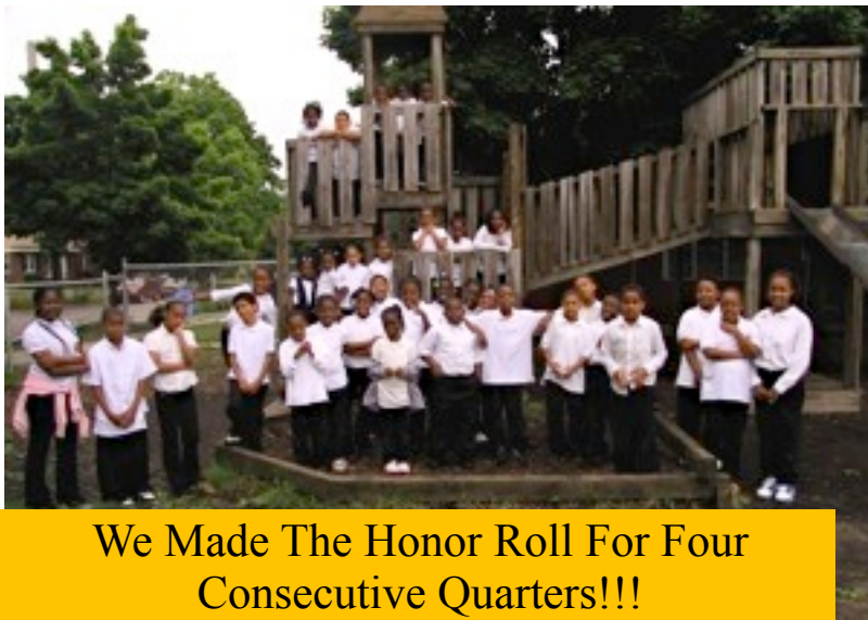
We Made The Honor Roll For Four Consecutive Quarters!!!